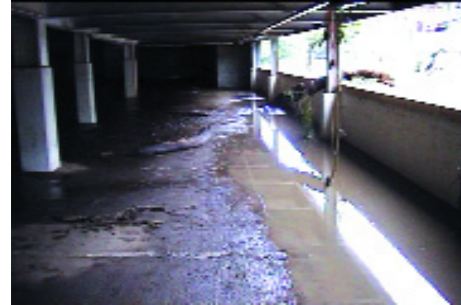
The underground car park right next to the River Don in Sheffield