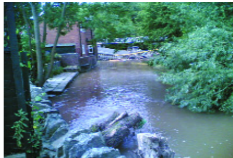
Ludlow: the collapsed bridge and flooding river caused devastation at the Unicorn Inn — twice over

“At one point we took 17 emergency calls from key accounts SGP, Unique Pub Company and Enterprise Inns for everything from sewage coming into a shop to sanitising cellars after the flood waters had subsided.