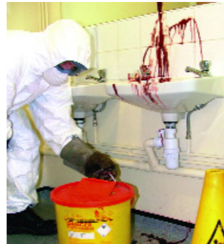
Active specialises in cleaning up biological hazards

You’ll realise by now that the sort of cleaning Active handles is not your aver-